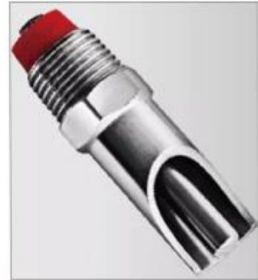
Weight: 83g Diameter: Opposite side 22mm Length: 63mm Valve Pole: 8mm Material: SUS 304SST