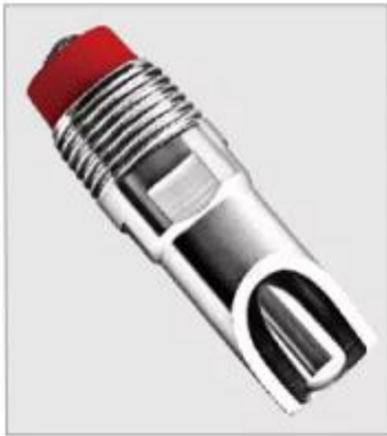
Weight: 65g Diameter: 21mm Length: 55mm Valve Pole: 8mm Material: SUS 304SST