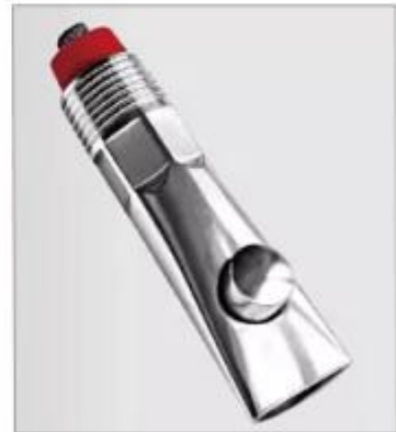
Weight: 118g Diameter: 21mm Length: 80mm Valve Pole: 10mm Material: SUS 304SST