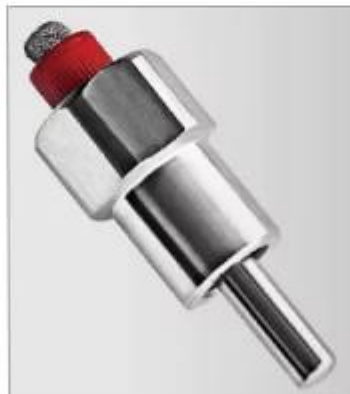
Weight: 100g Diameter: 24mm Length: 60mm Valve Pole: 8mm Material: SUS 304SST