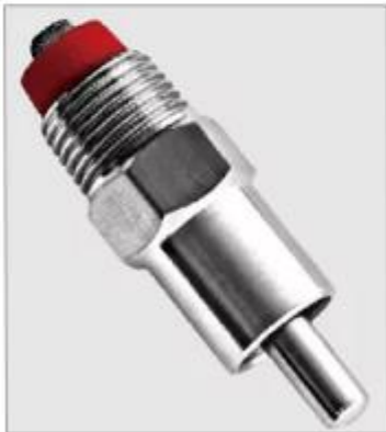
Weight: 65g Diameter: 21mm Length: 55mm Valve Pole: 8mm Material: SUS 304SST