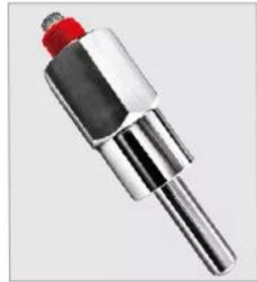
Weight: 118g Diameter: 21mm Length: 80mm Valve Pole: 10mm Material: SUS 304SST