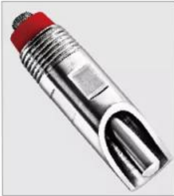
Weight: 80g Diameter: 21mm Length: 63mm Valve Pole: 8mm Material: SUS 304SST