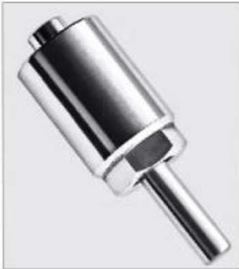
Weight: 100g Diameter: 24mm Length: 60mm Valve Pole: 8mm Material: SUS 304SST