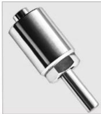
Weight: 100g Diameter: 24mm Length: 60mm Valve Pole: 8mm Material: SUS 304SST