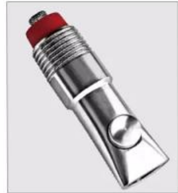
Weight: 79g Diameter: 22mm Length: 63mm Valve Pole: 8mm Material: SUS 304SST